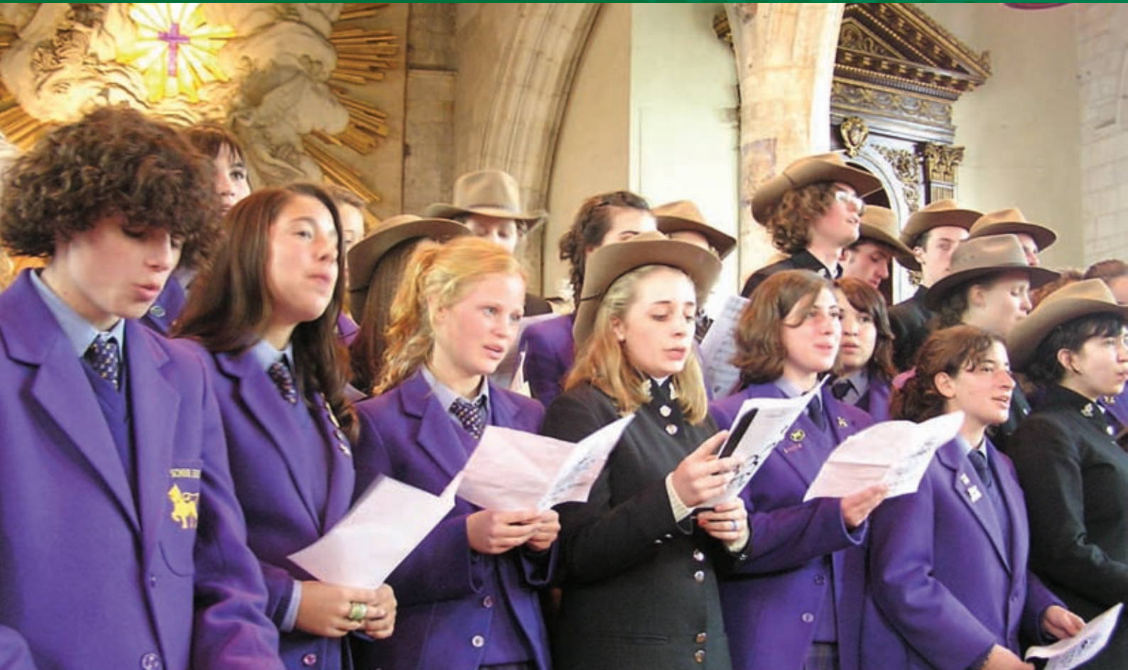
Wesley College Melbourne and St Andrews Cathedral School Sydney - Singing in the Eglise de St Leu Amiens (ANZAC 2006)