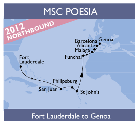
Fort Lauderdale to Genoa