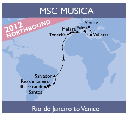
Rio de Janeiro to Venice