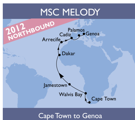
Cape Town to Genoa

2 PEOPLE CRUISE FOR THE PRICE OF 1 on all of these departures in 2011 & 2012.*